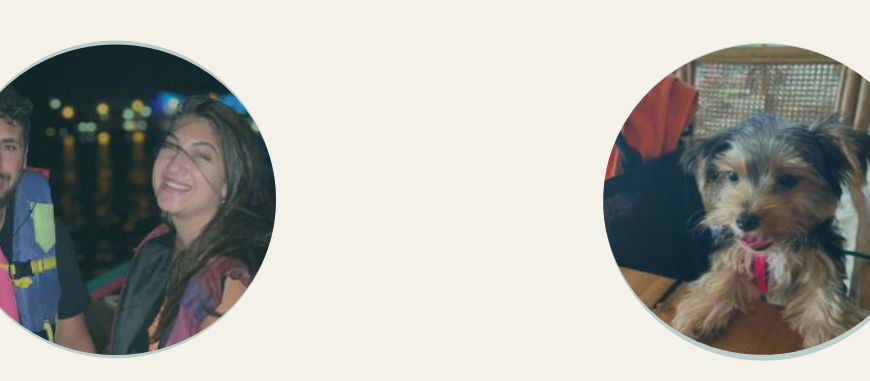
Shahar & Yarden