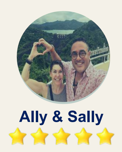
The best trip in Thailand by far this is why we've created it