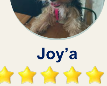
Wraf! Wraf! Cheers Ally & Sally for taking me to this amazing trip