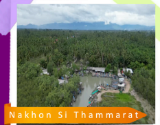
Nakhon Si Thammarat

06:00 Pick-up to an authentic Fishermen's Village at the heart of our Mangrove Forest Plantation 06:30 Long Tail boat tour through our vast Mangrove forest, mineral mud bath in shallow waters in mid-sea and a light local breakfast 09:00 Shower & Local Tea Cleansing-off the Mud, walking in the village and tasting local tea 10:00 Outdoor Cooking Lesson experimental & authentic local dishes as well as cooking the mangrove leaves, daily caught fishery and more 11:00 Lunch Spectacular Thao-Malay lunch in the heart of the Fisherman's village and touring around vocal points