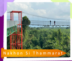
Nakhon Si Thammarat

06:00 Pick-up to an authentic Fishermen's Village at the heart of our Mangrove Forest Plantation 06:30 Long Tail boat tour through our vast Mangrove forest, mineral mud bath in shallow waters in mid-sea and a light local breakfast 09:00 Shower & Local Tea Cleansing-off the Mud, walking in the village and tasting local tea 10:00 Outdoor Cooking Lesson experimental & authentic local dishes as well as cooking the mangrove leaves, daily caught fishery and more 11:00 Lunch Spectacular Thao-Malay lunch in the heart of the Fisherman's village and touring around vocal points